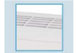
Moving Air Supply grill

The D950E is a medium large size, floor standing or wall mounting condensation dehumidifier, designed for large floor area application. It is a general purpose machine for controlling medium range humidity. It has a good air circulation versus drying capacity ratio. As such no messy duct work is required when this unit is used. Unlike larger models which have very large drying capacity, which require air distribution channels like duct work to convey the dry air from one part of the room to another, the D950 covers good range of floor area. The strong blower circulates the dry air evenly. Therefore, it is ideal for large space dehumidification application. Multiple units are placed at strategic corners of a large space. Installation work is minimal, with no than a simple 230 VAC power supply and common drain pipe