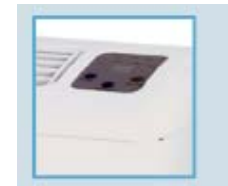
Digital Control Panel with RH display